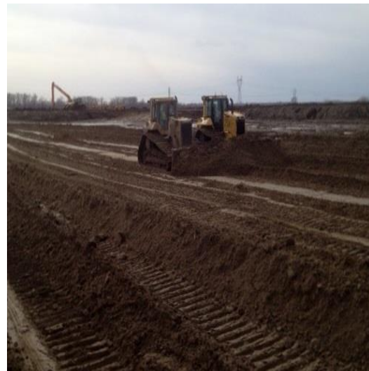
(C & M dozers working in unison to fill the breach area on Consolidated North)

You may reach Irv at irv@candmcontractors.com